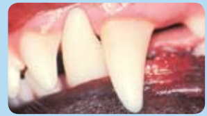
(a) Healthy mouth

Unfortunately once a tooth becomes loose, the problem has usually progressed too far to save that tooth. However if gum problems are identified at an earlier stage, a combination of a Scale and Polish and ongoing Home Care can make a real difference to your pet's oral health (and also their breath!). Please contact us today for further details!