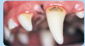
(b) Gingivitis – with early calculus